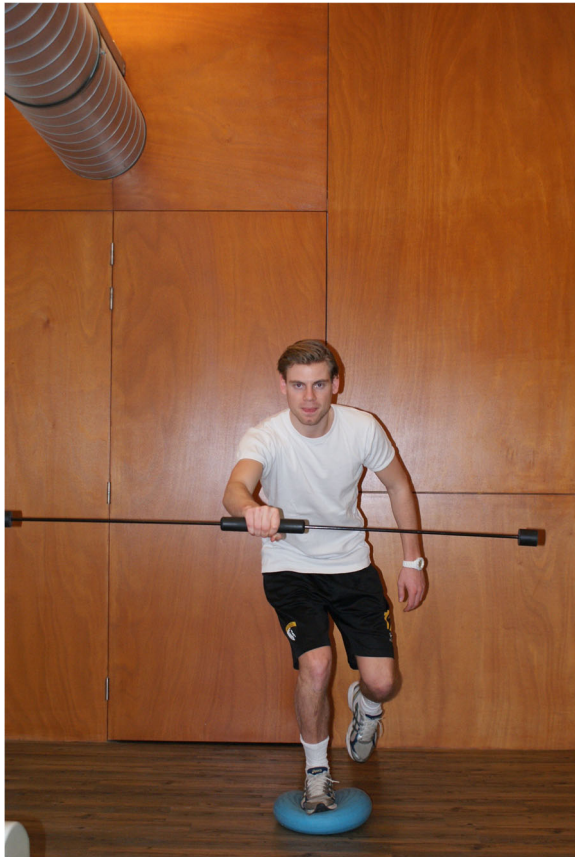
Fig. 2 Postural stability. An athlete is practicing to improve postural stability. To promote an external focus of attention the athlete should be instructed to “focus on keeping the bar horizontal”. Instruction such as “stabilize your knee” are less effective because this induces an internal focus of attention