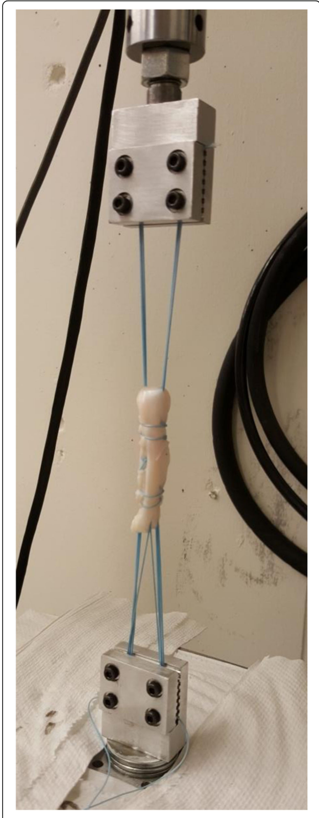
Fig. 2 A quadrupled tendon suspended using No. 5 suture from clamps in the MTS machine

The dimensions of the tendons and graft constructs for each of the preparation techniques, prior to testing, are reported in Table 1 with the associated post hoc pairwise comparisons reported in Table 2. No significant differences were found in the dimensions of the Quad-A vs Quad-B groups in terms of tendon length (p > 0.999),