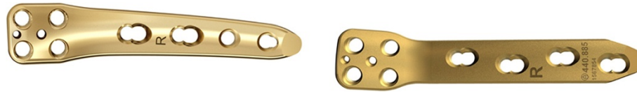
Figure 2 Both the anatomical MDF plate, left, and the antecedent MDF plate, right. The anatomical MDF plate has an optimized shape, to better fit the distal femur; it has improved screw-hole directions, and is shorter and slimmer, but equally thick.

Vantico GmbH, Wehr, Germany) in a specially constructed fixture; the fixture allowed for mounting of the femur in a materials testing machine (MTS) (Mini Bionix, MTS Systems Corporation, Eden Prairie, MN, USA) (Figure 3). The fixture was designed in such a way that the axis of loading of the replicate femur in the MTS was through the centre of the femur head proximal and through a point 18-mm medial from the mid-condylar distance, creating a mechanical femur axis of 2°; reproducing loading in the normally aligned human knee after a supra-condylar femur osteotomy (SCO) for valgus osteoarthritis.