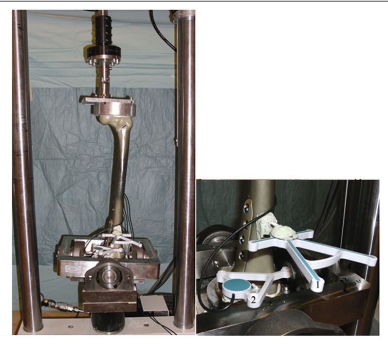
Figure 3 Overview of the test setup used. Left: the entire setup, the femur loaded in the MTS. Right: Close-up of the measuring system; 1 and 2, microphone and speaker templates.

SCO was defined as the difference between the maximum increase and maximum decrease in the distance between measuring points; determined for each cycle and per measuring point. A greater mean difference calculated over 100 cycles and 3 measuring points indicates more motion allowed by the bone-implant construct. Stability was subsequently defined as the amount of motion allowed by the construct. A similar approach was used in the torsional tests. The amount of motion was calculated by determining the amount of rotation around the Z-axis that is allowed by the bone-implant construct during each cycle. Stability in torsion was defined as the amount of rotation allowed by the construct. The stiffness under axial compression of the construct was calculated by plotting displacement at the SCO during the failure test, defined as the average amount of movement on the Z-axis of the 3 previously defined point pairs, against the force data. Stiffness of the bone-implant construct was defined as the slope of the linear portion of the force - deformation curve (i.e. the force required per millimeter of displacement). Stiffness under torsion loading was calculated by plotting the rotation around the Z-axis over time against the moment (Nm) applied by the MTS and defined as Nm required for one degree of rotation.